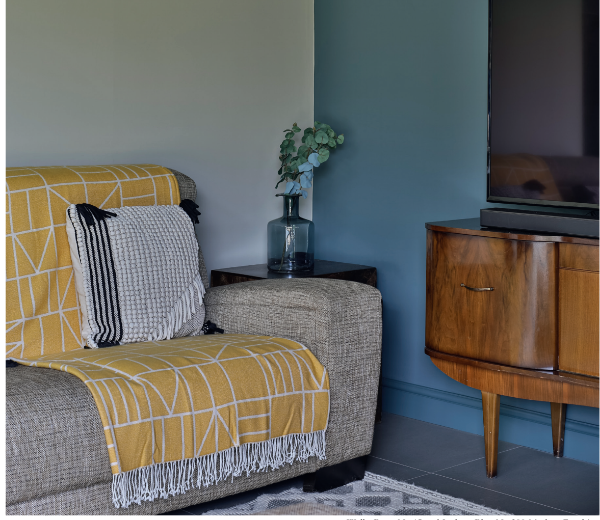
Walls: Bone No.15 and Inchyra Blue No.289 Modern Emulsion